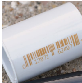
Laser code (colour change)

Printed codes and marks are often the most visible indicator of your brand values and product quality. The legibility and appearance of logos, production and time stamps, bar codes and other marks can all contribute to perceived quality.