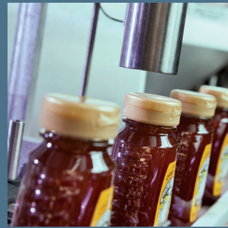
Videojet 1510 printing on-line

Dutch Gold Honey continues to see more and more coding requirements every year and is able to meet customers’ needs as they change. The CLARISUITE system allows them to expand and gives them the comfort to know that all the information is correct and will meet their customers’ needs.