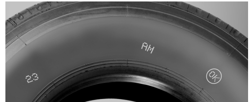
High impact codes in red, yellow, blue and white