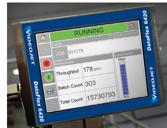
Easy-to-use, intuitive equipment