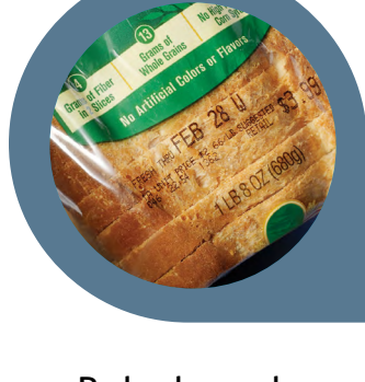
Baked goods & cereal