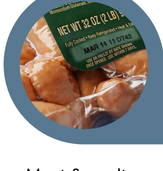
Meat & poultry