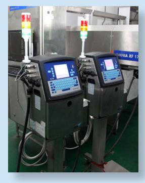
2 Videojet 1610 printers integrated into Sundaily's production line

CleanFlow<sup>™</sup> printhead technology reduces ink buildup that can cause traditional CIJ printers to shut down. Therefore, the 1610 requires less cleaning and helps ensure longer runs. Positive air is also used to prevent dust in the environment from contaminating the printhead