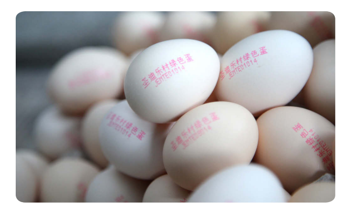
Red ink specifically designed for eggs

In order to ensure quality of the printed codes, fast dry and non-diffusion features are required for inks used in this application. With its old combination of CIJ printers and ink from other manufacturers, Sundaily was unable to print a crisp and clear code. The ink would bleed on the egg, resulting in an almost illegible code that did not meet the strict standards of Sundaily's customers.