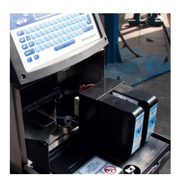
Smart Cartridge™ fluid delivery system in the Videojet 1710 coder

"When you combine our high production speeds, hot temperatures and factory environmental conditions, you need tough inks—and a printer that won't clog up when you run them," Ju ChaoRong explains. "We've found this with Videojet. We can run any ink we need—including pigmented, high-contrast ink—in the 1710 coders without problem. And the ink dries very quickly with excellent adhesion, supporting our fast production speed."