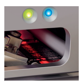
Videojet iAssure<sup>™</sup> technology, a built-in code quality checker helps reduce waste and rework