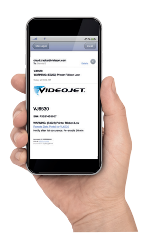
* Subject to availability in your country