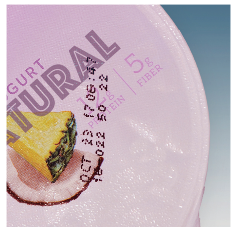
Examples of codes impeding product messaging