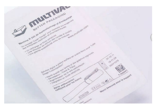
Medical Device package with Tyvek® lidding