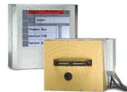
Videojet IP DataFlex Plus TTO

Videojet IP65 and IP66 rated coders are designed for washdown environments and utilize superior 316 grade stainless steel. Contact Videojet to discuss your variable coding needs today.