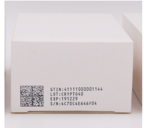
A typical Crypto-Code with a symbol size of 36x36 modules printed with the Wolke m610 advanced.

*The specified product speeds are the maximum possible printing speeds. They can be reduced by factors such as the substrate to be printed, the ink used, the integration of the printer, or the transport guide of the folding box.