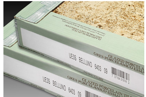
High-resolution large character inkjet on white corrugate

Ask your local Videojet representative for more guidance, a production line audit, or sample testing in our sample laboratories.