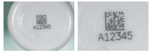
High contrast UV laser mark on HDPE bottle