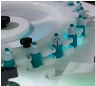
Star wheel transport for positive bottle control during marking