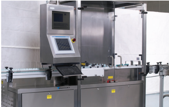
FP Developments packaging solution including Videojet UV laser installation

Videojet worked closely with FP Developments to ensure the proper integration of the UV lasers into their packaging equipment. With over 50 years of packaging machinery design experience, FP Developments created a solution that provided very smooth material handling, a prerequisite for marking high quality DataMatrix codes at the specified line throughput. In addition, the Videojet UV laser software included arc compensation as a standard feature. This software feature further increased the DataMatrix code quality by compensating for the trajectory of the product on the rotary material handling device (star wheel). Operational and coding requirements vary among companies, so the ability to easily tailor the system to meet these needs is critical. User-defined parameters and set up options help companies easily achieve their individual level of code detection.