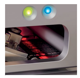
Videojet iAssure™ technology, a built-in code quality checker helps reduce waste and rework