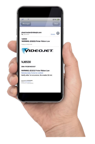
* Subject to availability in your country