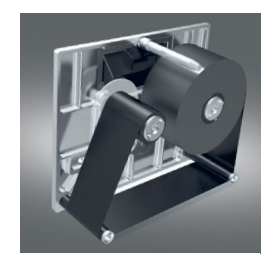
Up to 1,200m ribbon capacity, providing more throughput between ribbon changes