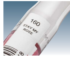
TTO code printed directly onto lip gloss label