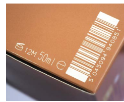
Laser bar code on carton

Large Character Marking (LCM) on cases. Large character ink jet printing is a cost-effective way to customize standard corrugate shipping cases. These systems can replace or customize your pre-printed shipping cases making them retail ready with product pictures, bar codes, logos and shipping information. Customized cases help enhance efficiency in your supply chain and allow adding software systems which track your product through the distribution channel.