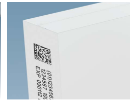
TIJ 2D bar code on paper carton