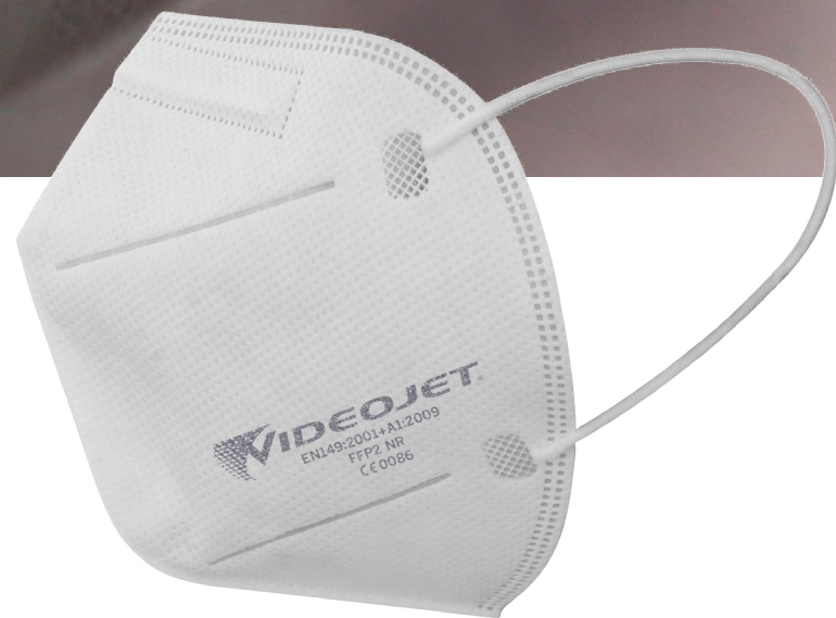
Medical masks (FFP2, FFP3, N95, KN95)